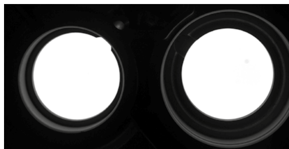
Machined hole inspection