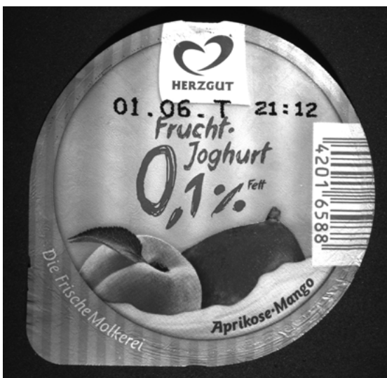
Aluminium cap for yoghurt pot under white light

Apart from its usefulness with coloured test objects, this is not the only place where longwave infrared radiation has an important role to play. Infrared lighting can also be used to look inside certain kinds of materials. This technique is used in inspections using backlight systems on conveyor belts, for example. Infrared radiation can also be used in combination with specialised filters to attenuate (block) extraneous light. In chapter 3, this technique will be looked at in detail.